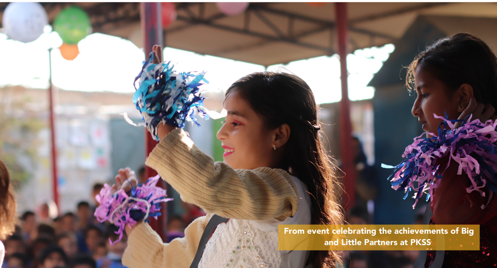
From event celebrating the achievements of Big and Little Partners at PKSS

Finally, by witnessing how the Big Partners were able to create positive change in their communities, new respect for children's agency was formed. Teacher perceptions around what children could achieve also evolved - while they started out unsure about whether or not they would be able to lead the sessions, by the second phase they were confident in the Big Partners' skills and even added in content that they felt would support their own work in the schools.